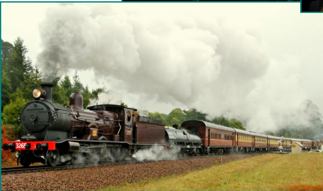
Left: 3265 returns to Sydney with the Cockatoo run on the 27th of October as it departs Robertson and the Railway Springtime Fair that was held on this particular occasion.