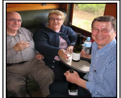
Above: Tertini Wine Tasting Father's Day 6th Sept on the Cockatoo Run. 11/10/09